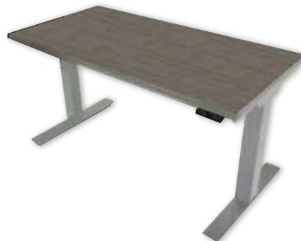
Driftwood Top/Grey Edge