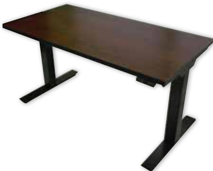
Espresso Top/Black Edge