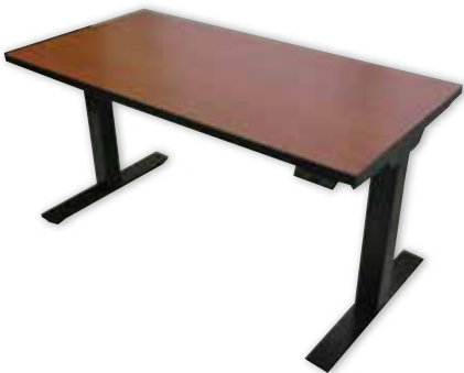
Cherry Top/Black Edge