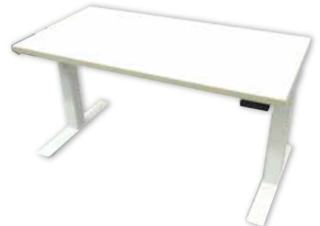
White Top/White Edge