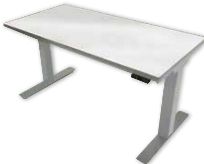
Nebula Top/Grey Edge